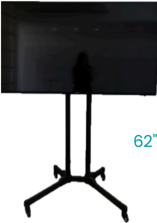
62" TV MONITOR