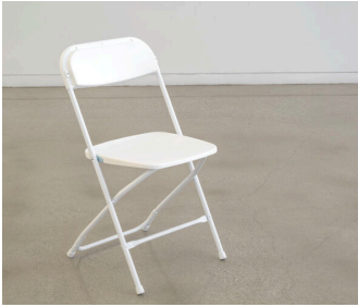
WHITE FOLDING CHAIR