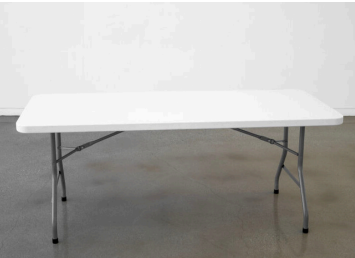
6' BANQUET TABLE