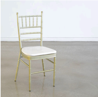
GOLD CHIVARI CHAIR