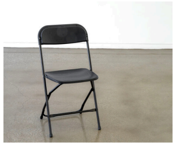
BLACK FOLDING CHAIR