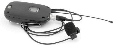
WIRED LAVALIER MICROPHONE