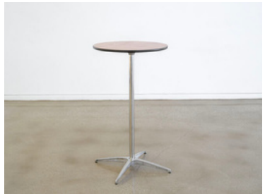
HIGH-TOP TABLE 23.5" x 42" or 30.5" x 40.5"