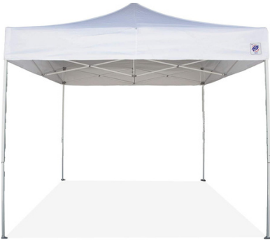
10' X 10' EZ UP CANOPY