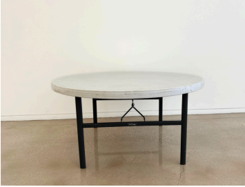
60" ROUND TABLE Seats up to 10 people