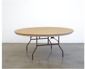
72" ROUND TABLE Seats up to 12 people