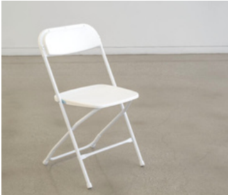
WHITE FOLDING CHAIR