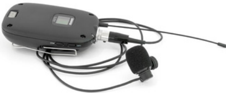
WIRED LAVALIER MICROPHONE