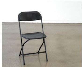
BLACK FOLDING CHAIR