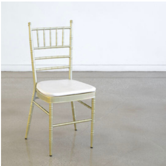
GOLD CHIVARI CHAIR