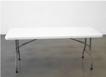
6' BANQUET TABLE