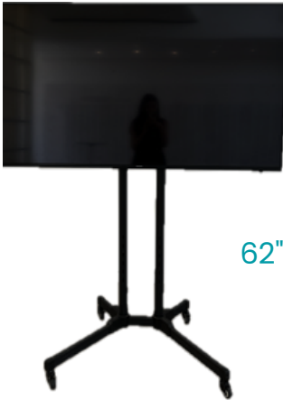
62" TV MONITOR